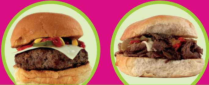
Sam'z ½ lb. Burger & Thin Sliced Rib-Eye Sandwich